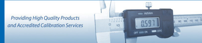
Providing High Quality Products and Accredited Calibration Services